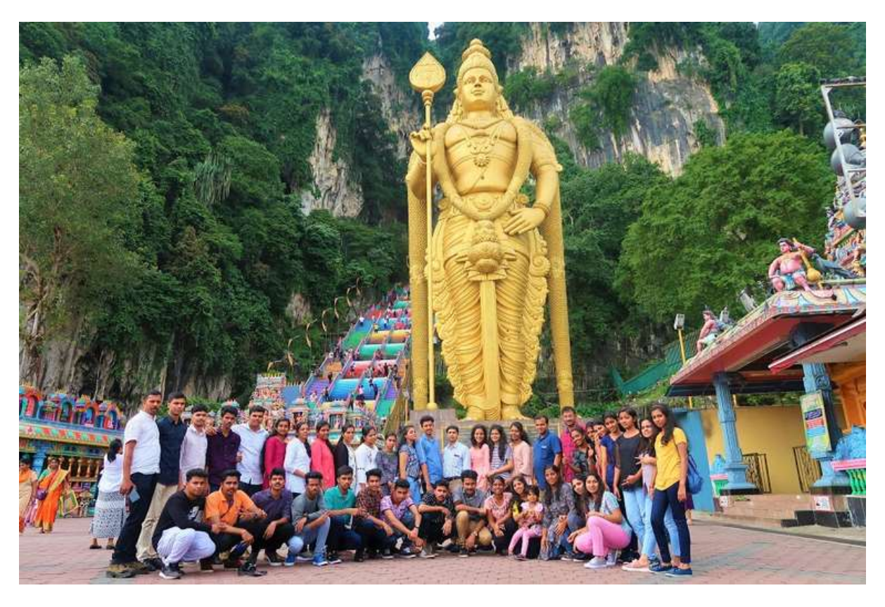
Figure: The exposure to the heritage places and the